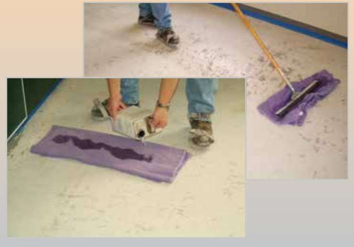
4) Wet towel with MEK and wipe floor