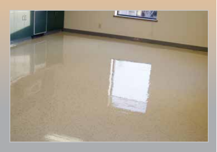
12) Apply topcoat of clear HI-TECH MAXIMUM SOLIDS EPOXY (included in your kit) over the chips to seal and smooth out the surface.