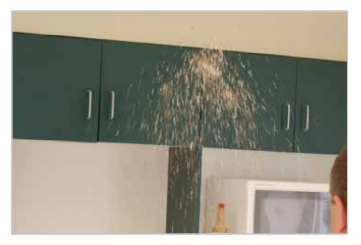
II) Broadcast the mixed color chips by throwing them into the air and letting them fall to the floor. You can always sprinkle more chips over any areas that are light.