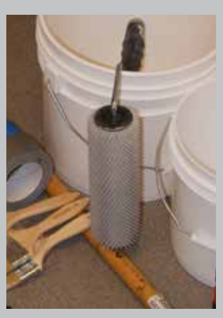
A porcupine roller is a must for breaking any air bubbles.