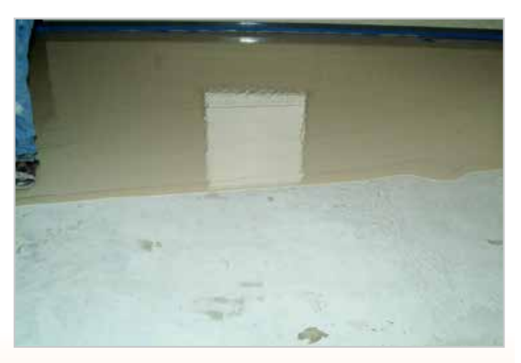
8) Distribute epoxy evenly, leaving enough material behind to maintain 7 wet mils or 200 sq.ft./gallon.