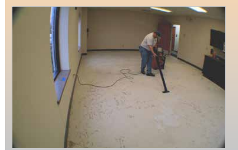
3) Vacuum the floor