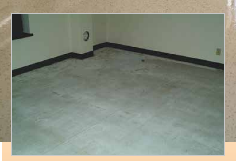
I) Grind the floor

Step-by-step instructions for a successful, beautiful and durable epoxy chip floor.