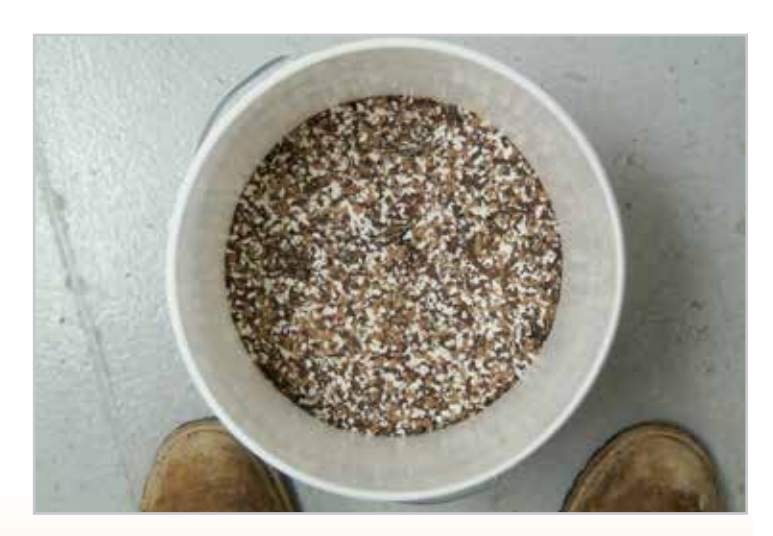
5) The colored chips come in a pail, but they need to be mixed before use.