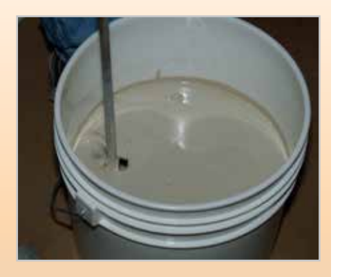
6) Mix the tinted basecoat of HI-TECH MAXIMUM SOLIDS EPOXY (included in your kit) on low speed so as not to induce bubbling. Mix for 3-5 minutes making sure to move the mixer around the pail.