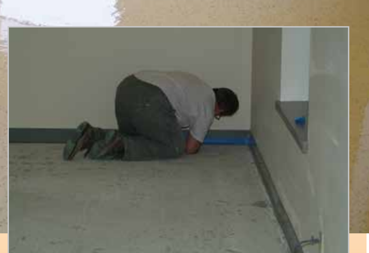
2) Tape the edges