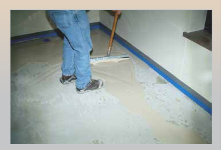
7) Once mixed, pour contents onto the floor and use a brush to do the edges and a squeegee to distribute the epoxy across the floor.