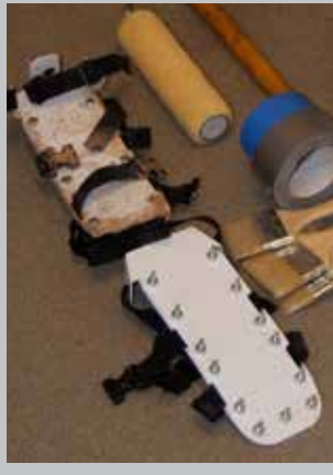
Spike slip-ons are a must for walking over epoxy without marring it.