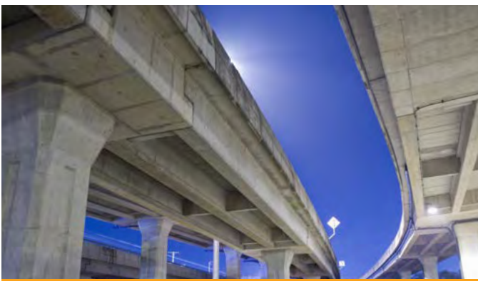
D.O.T. + Bridges