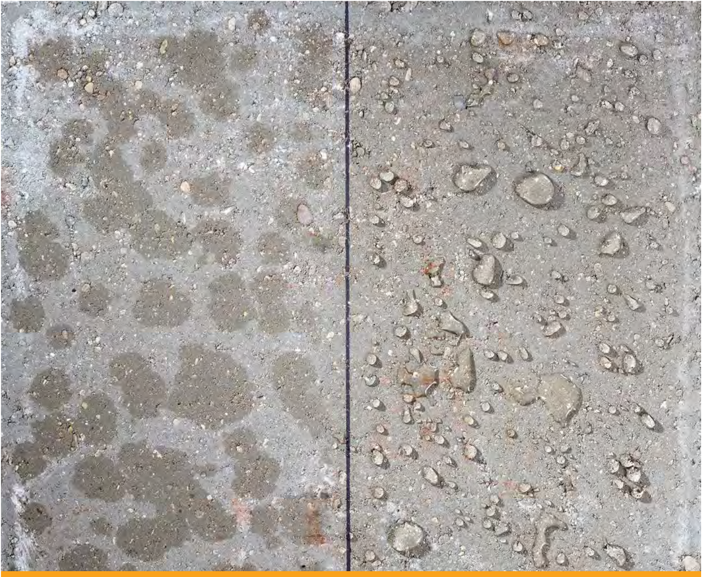
untreated (left) versus treated (right)