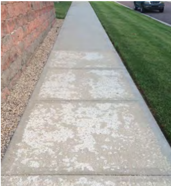
The dramatic difference between untreated surfaces (at bottom) and those treated with Salt Protector Plus™ WB (at top) is clearly shown above.