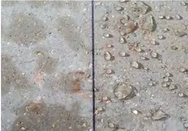
Untreated concrete (left) versus concrete treated with Salt Protector Plus™ WB (right).

Salt Protector Plus™ WB acts as a barrier against water and salt which can damage and deteriorate exterior concrete and masonry. With its remarkable beading action, Salt Protector Plus™ WB offers visual proof of water repellency.